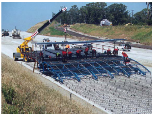
The OK STEELEX Mechanical Jig & Truck Mounted Work Platform in action laying CRCP steel for the M7 Tollway. 10,000 tonne of steel was installed on the Project using this method.

Not only is production much improved over manually laying CRCP, OH&S is greatly improved through rotating workers through the various activities. This jig method won WorkCover's 2005 Award for Best Solution to a Workplace Manual Handling Hazard.